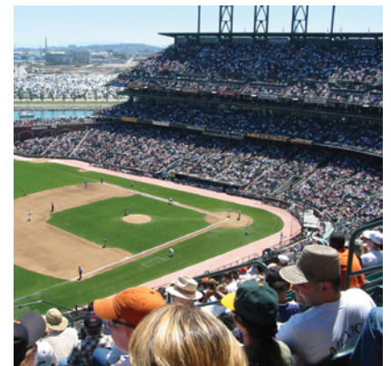
ProRAE Guardian is ideal for threat monitoring and detection of large-scale public venues